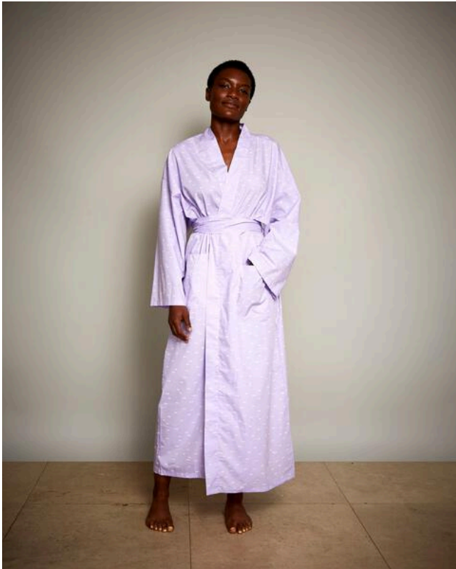
JOBO Robe: Li-lac/Cream - 2 dot