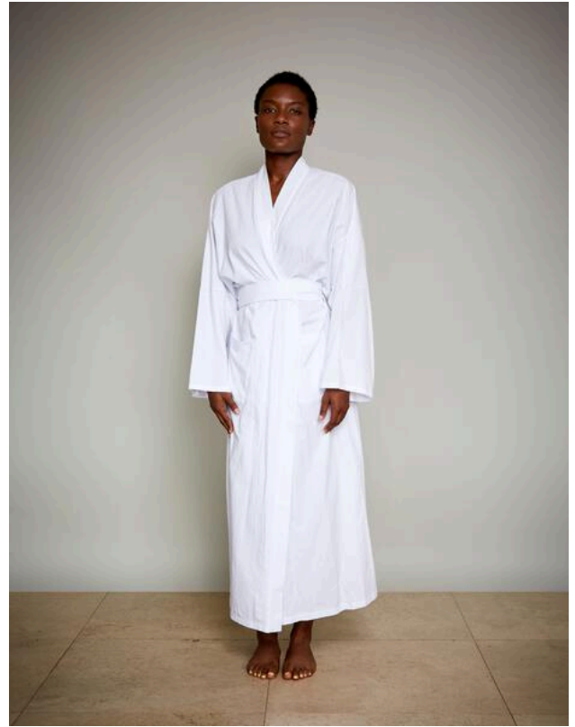
JOBO Robe: Bright White Seersucker