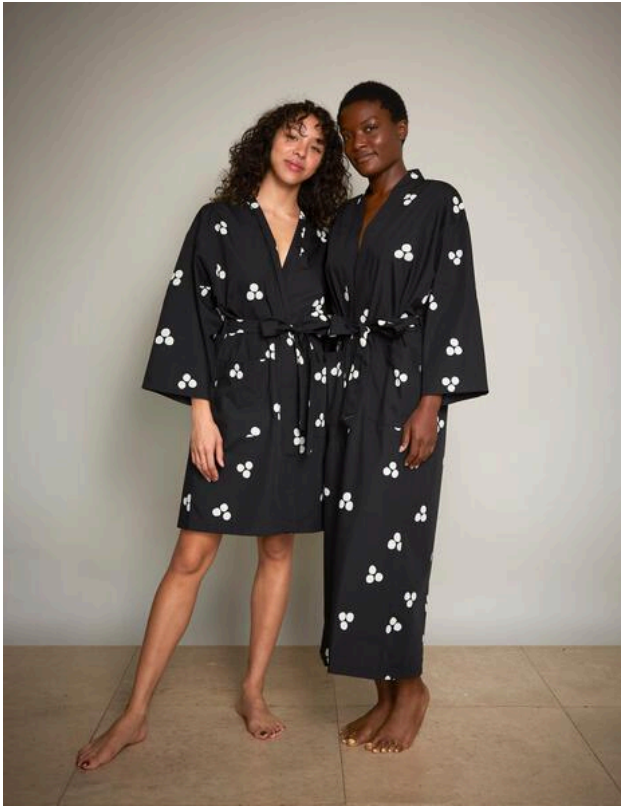
JOBO Robe: Ivory on Obsidian