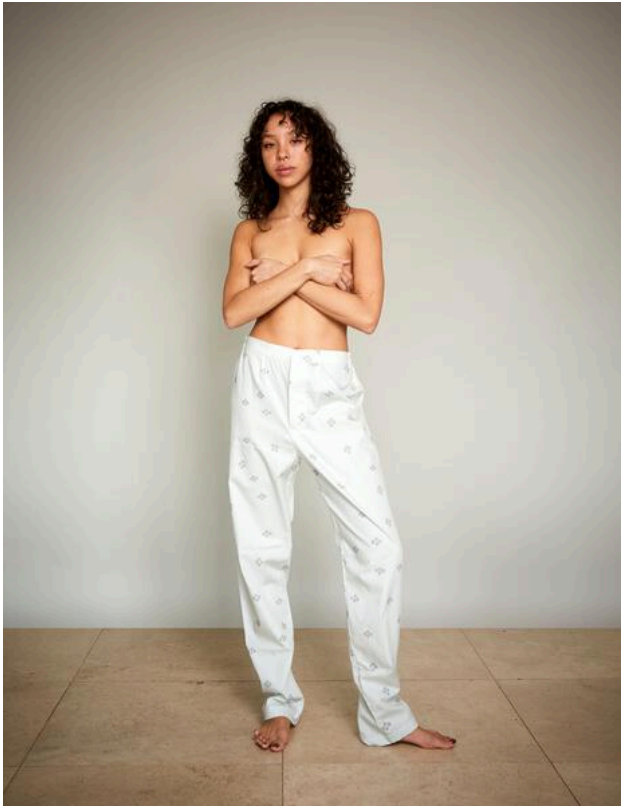
JOBO Pajama: Pant in Seafoam