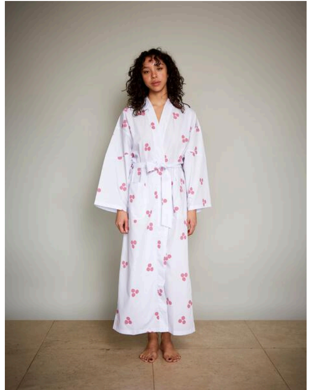
JOBO Robe: Raspberry Beret - 3 dot

Our custom printed signature robe will be there for you night and day. Easy peasy and light enough to sleep in. Ever wonder why some sheets last and last, getting softer with age? They're a blend. Our favorite, smooth cotton/poly blend makes our robes super long-lasting, with a minimal energy footprint to wash and dry, however you chose to care for your Jobo robe. Bonus, our robes take very little room to pack so you can bring yours anywhere. Guaranteed the most stress-free robe you'll ever own.