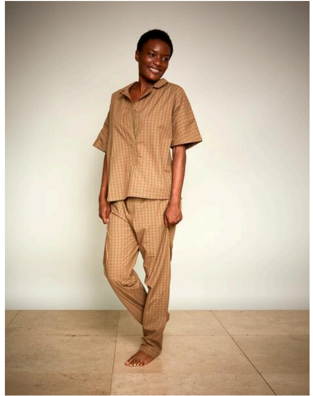
JOBO Pajama: Tartan Plaid

P.J.s with a twist! Pajama pants are tapered and offer traditional styling at the waist with front button closure and hidden button fly. Elastic at the back for comfort and fit.