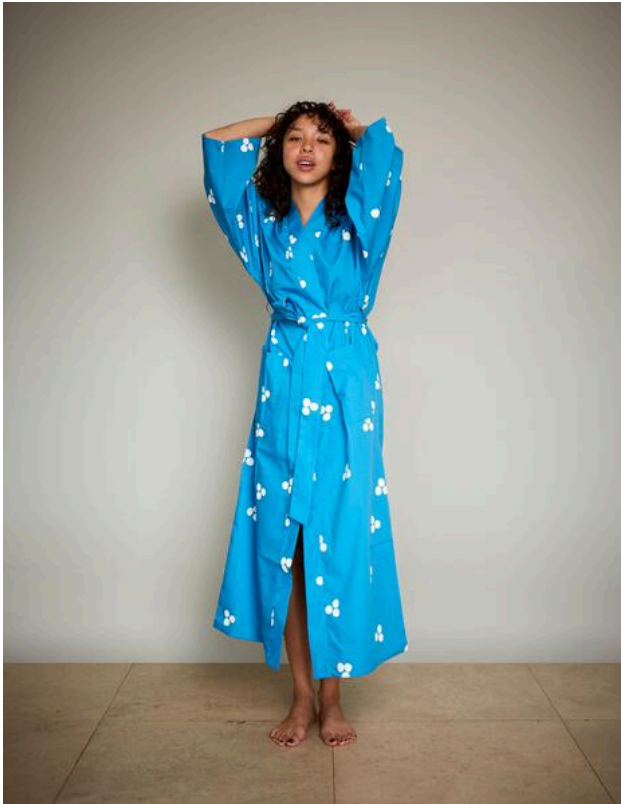
JOBO Robe: Surf's Up! - 3 dot J-ROBE-SURFS